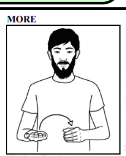
Working flat hand (palm up, pointing forward) moves and turns over onto supporting full "C" hand (palm in, pointing forward).

We have begun teaching the children a sign of the week to promote inclusivity as well as develop language skills. Here is this week's sign if you would like to practise at home.