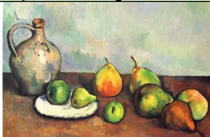
Cezanne – Still Life, pitcher & fruit 1894