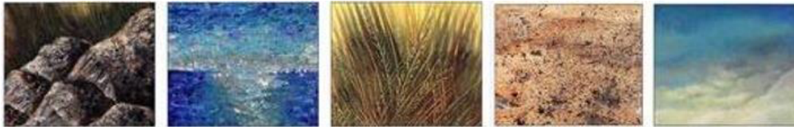
sponging stippling scrape (sgraffito) impasto blend