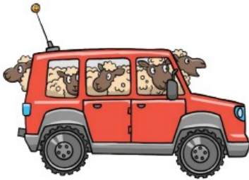
sheep in a jeep

Smile with your lips apart and say ee ee ee