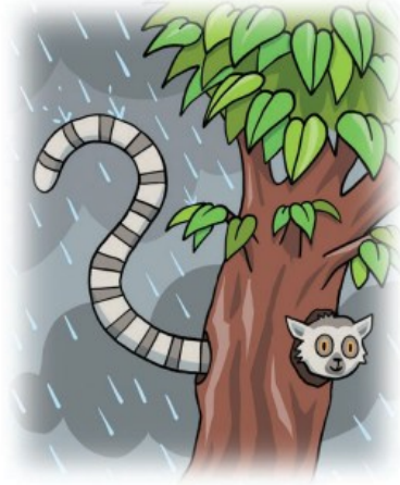
tail in the rain