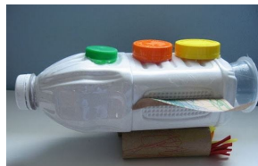
Make something new using recycling materials