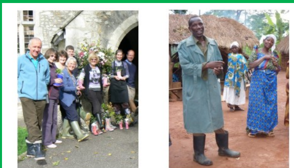
People having fun together